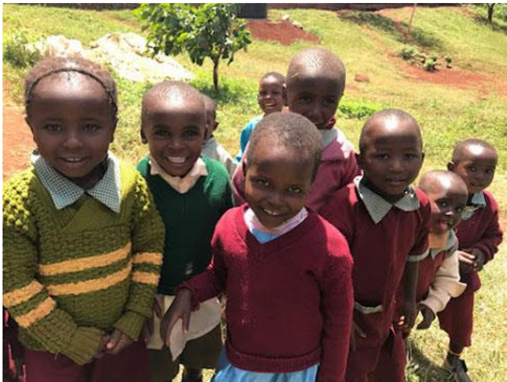
Happy students saying "Thank you, LWML" for the clean water and pastoral care!