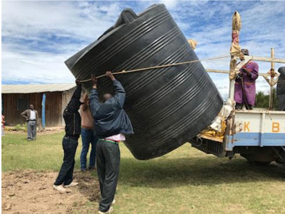
A water tank being put into place by hand.

One of the water filters Water and the Word provides to schools. Each school gets 2–4 filters, depending on their student population.