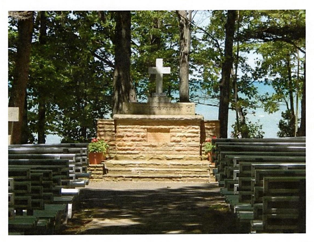
Come to Our Congregational Outreach Picnic, Sunday, July 14th