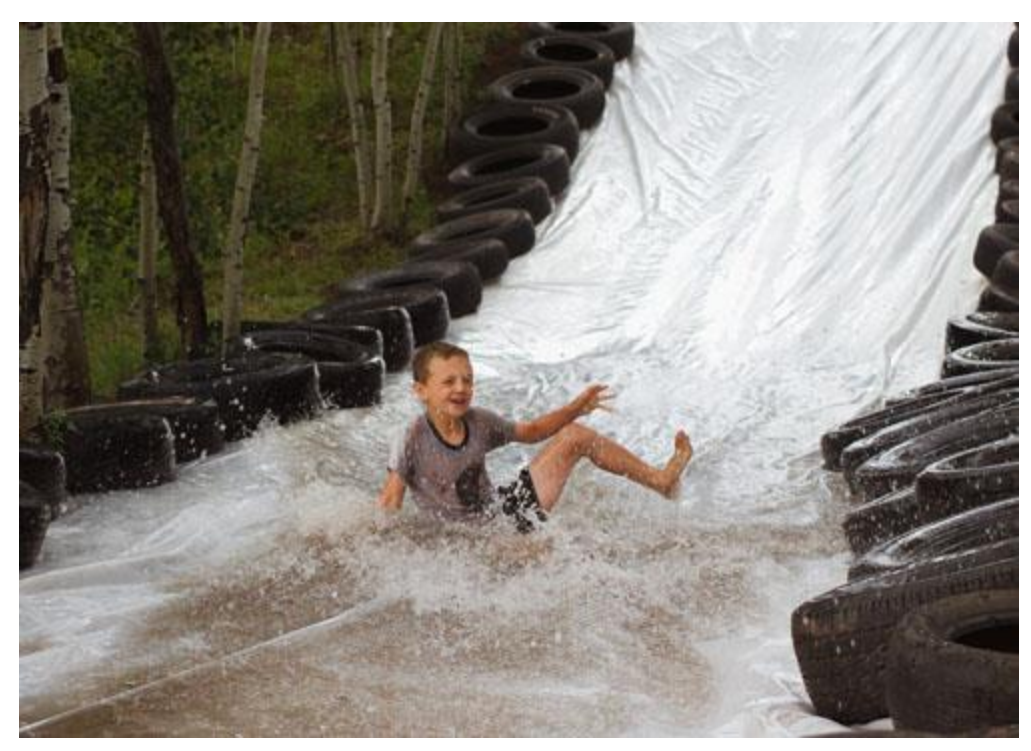
From Psalm 23:3-4 Who may stand in the Lord's holy place? He who has clean hands and a pure heart.

This camper is flying down the LVR handicap accessible zip-line. Even adult campers with disabilities get to soar through God's creation!