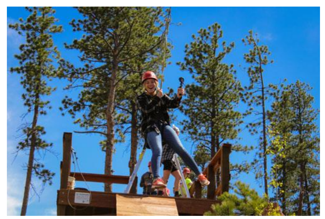
Isaiah 40:31 Even youth grow weary, and young men stumble and fall, but those who hope in the Lord will renew their strength. They will soar on wings like eagles.

This camper is flying down the LVR handicap accessible zip-line. Even adult campers with disabilities get to soar through God's creation!