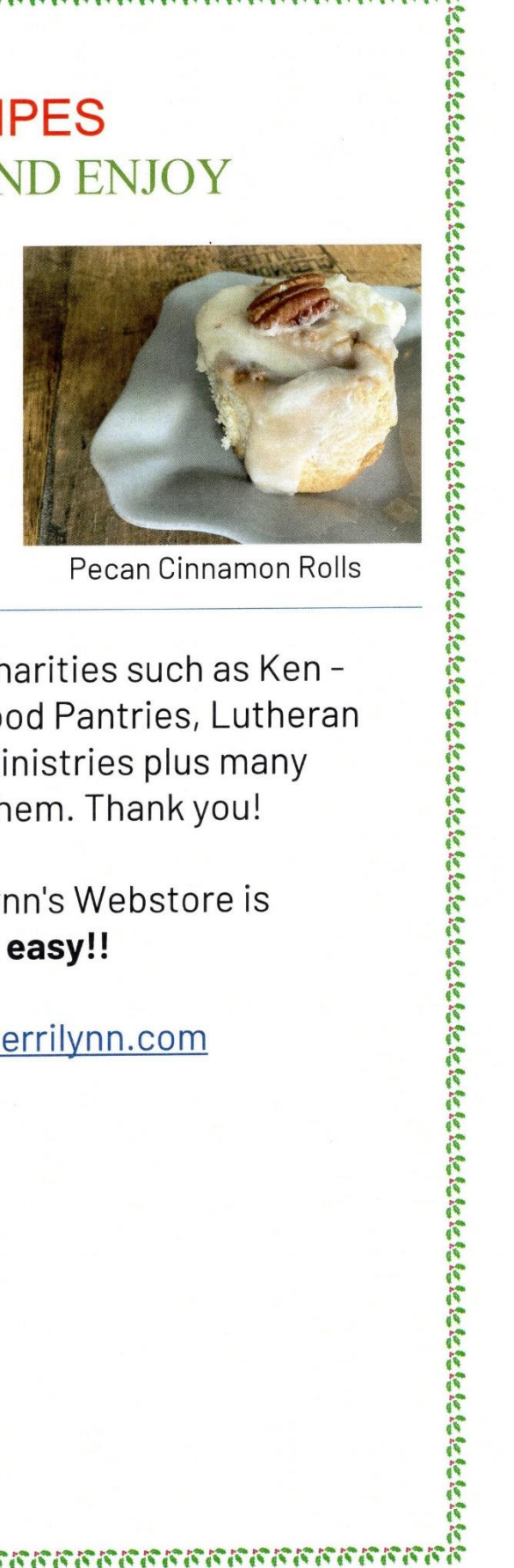
Pecan Cinnamon Rolls

https://www.terrilynn.com/resources/recipes/easypecan-cinnamon-rolls